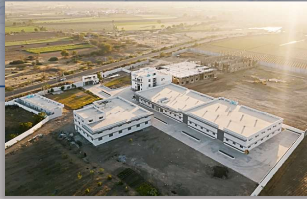
HEX - HCA factory at Jamnagar, Gujarat

HEX is a globally renowned brand for Cable Lugs, Cable Glands, Crimping Tools and Earthing & Lightning Protection Systems.