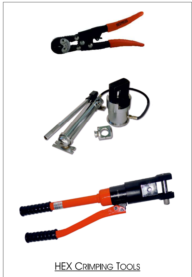
HEX CRIMPING TOOLS