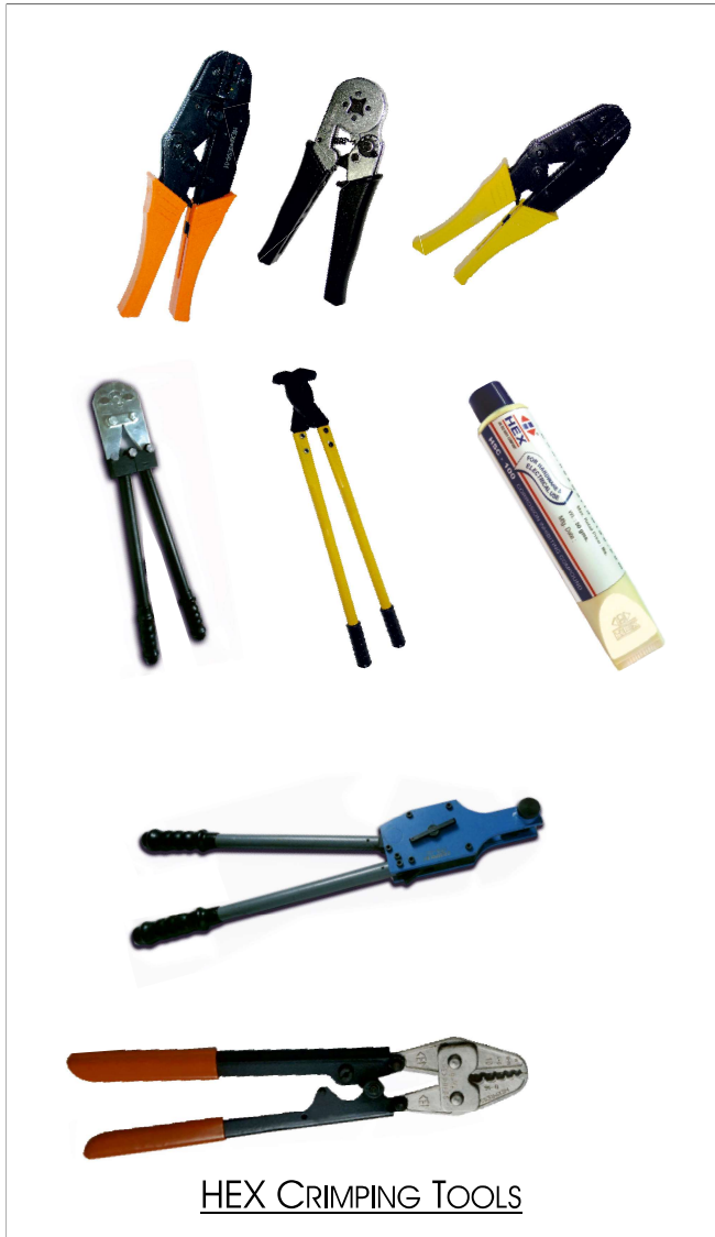
HEX CRIMPING TOOLS