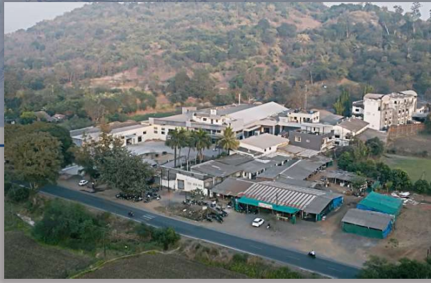
HEX - BCA factory at Vapi, Gujarat