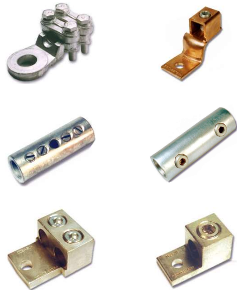
HEX RANGE OF MECHANICAL CONNECTORS